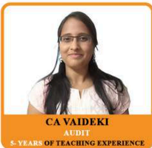
CA VAIDEKI AUDIT 5- YEARS OF TEACHING EXPERIENCE