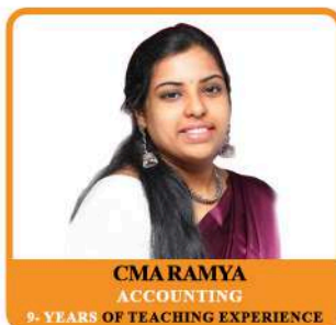
CMARAMYA ACCOUNTING 9- YEARS OF TEACHING EXPERIENCE